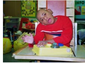
A child plays with adapted toys as part of his therapy.

abilities and adapt them accordingly. We then distribute these toys to children with disabilities via our agency partners.