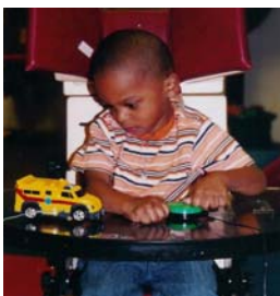
Adapted toys are easier to play with for children with disabilities.

We fulfill our mission by repairing devices and adapting a wide range of battery-operated toys, therefore increasing not only the number but also the variety of toys and devices that are available for children with disabilities.