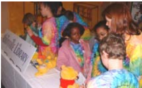
A presentation to teach elementary school students about disabilities.