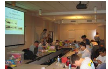
Educational seminars teach individuals and organizations how to adapt toys.

Volunteers learn about disabilities and electronics.