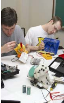
Volunteers repair toys that will be distributed to the agencies served by RePlay for Kids .

“OUR MISSION IS TO INCREASE THE AVAILABILITY OF TOYS AND ASSISTIVE DEVICES FOR CHILDREN WITH DISABILITIES.