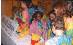
A presentation to teach elementary school students about disabilities.