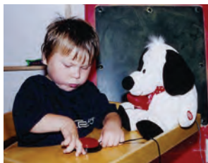
A child with cerebral palsy plays with an adapted toy dog. This dog was adapted to allow a larger switch to be plugged into it, which makes it easier to hit.

shops, during which volunteers spend a couple hours repairing and modifying toys. Since we utilize small, portable toolkits, our workshops can be set up in a variety of locations. Workshops have been held at sites such as NASA, Ernst & Young, Nestle, Fifth Third Bank, Deloitte, and Keithley Instruments.