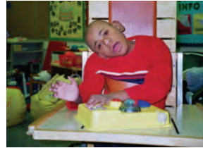
A child plays with adapted toys as part of his therapy.

abilities and adapt them accordingly. We then distribute these toys to children with disabilities via our agency partners.