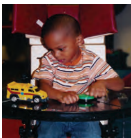
Adapted toys are easier to play with for children with disabilities.

We fulfill our mission by repairing devices and adapting a wide range of battery-operated toys, therefore increasing not only the number but also the variety of toys and devices that are available for children with disabilities.