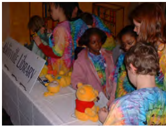
A presentation to teach elementary school students about disabilities.