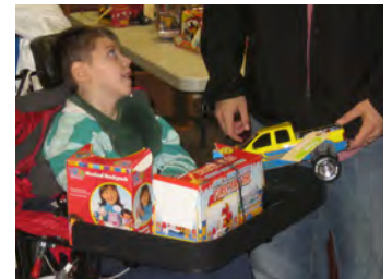
A child receives toys adapted by RePlay for Kids.

Kids, we are always looking for opportunities to increase the number of agencies that we serve.