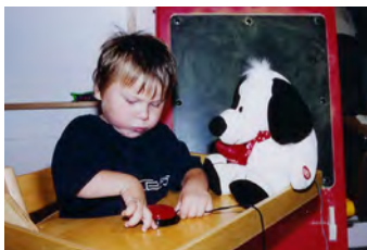
A child with cerebral palsy plays with an adapted toy dog. This dog was adapted to allow a larger switch to be plugged into it, which makes it easier to hit.