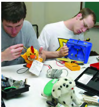
Volunteers repair toys that will be distributed to the agencies served by RePlay for Kids.

“OUR MISSION IS TO INCREASE THE AVAILABILITY OF TOYS AND ASSISTIVE DEVICES FOR CHILDREN WITH DISABILITIES.”