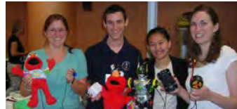
Educational seminars teach individuals and organizations how to adapt toys.