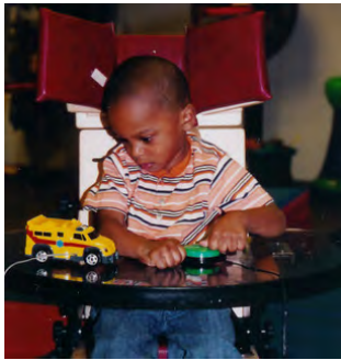
Adapted toys are easier to play with for children with disabilities.

At RePlay for Kids , our mission is to increase the availability of toys and assistive devices for children with disabilities. We fulfill our mission by repairing